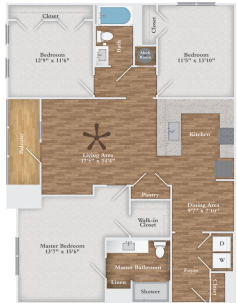
THREE BED | TWO BATH 1455 sq.ft.

Proudly managed by Pedcor Homes Corporation