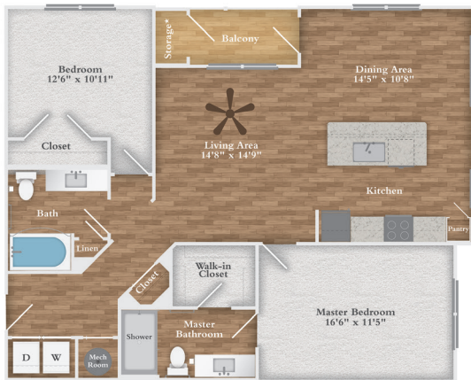
TWO BED | TWO BATH 1197 sq.ft.