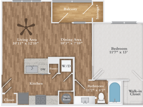
ONE BED | ONE BATH 707 sq.ft.