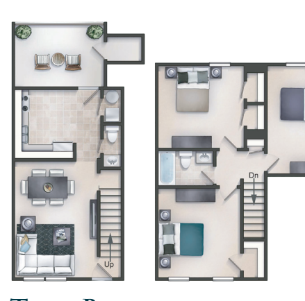
THE BELMONT THREE BED I ONE & ONE-HALF BATH 1200 sq.ft.