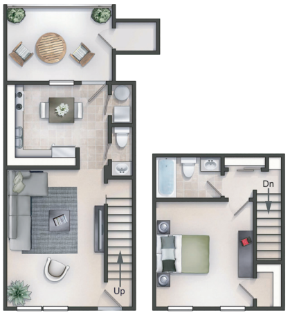
THE PADDOCK ONE BED I ONE & ONE-HALF BATH 900 sq.ft.