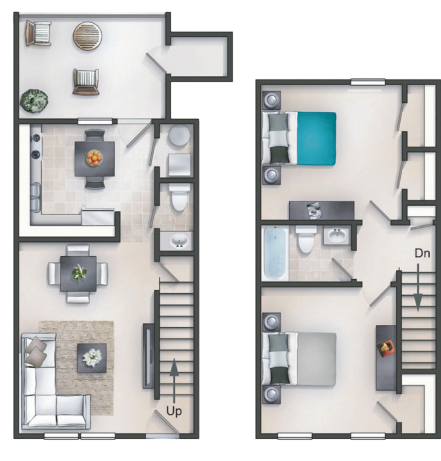
THE STEEPLEHOUSE TWO BED I ONE & ONE-HALF BATH 1100 sq.ft.