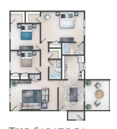
THE SARATOGA THREE BED I TWO BATH 1400 sq.ft.