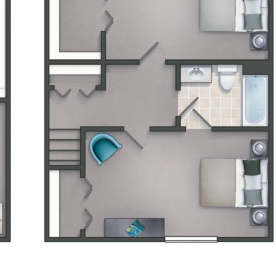
THE AMELIA TWO BED I ONE & ONE-HALF BATH 1000 sq.ft.