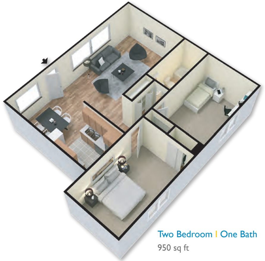
Two Bedroom | One Bath 950 sq ft

With fantastic views of the Caloosahatchee River, downtown Fort Myers is everything you love about Florida with an urban twist. Home to Centennial Park, a riverside park that is home to the Downtown Farmers Market. As a hub for the arts, Downtown Fort Myers features the ArtFest Fort Myers, the Fort Myers Film Festival, the Sidney & Berne Davis Art Center, and the Florida Repertory Theatre. Several of Florida's favorite beaches are located just minutes from downtown, including Fort Myers Beach, Sanibel Island, and Captiva Island.